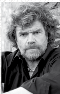
Left: Reinhold Messner