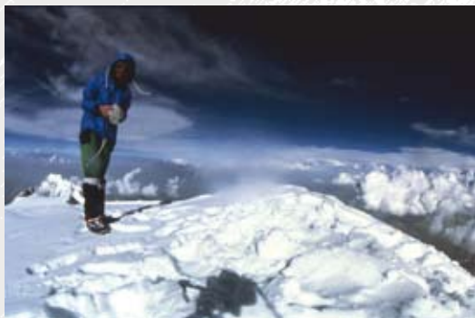
Below: Messner on Nanga Parbat